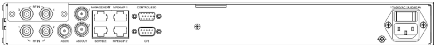
ProView 8105 Descrambler ASI, IP and MPE data outputs

Three ProView 8100 configurations are available to meet a variety of customer applications and price points.