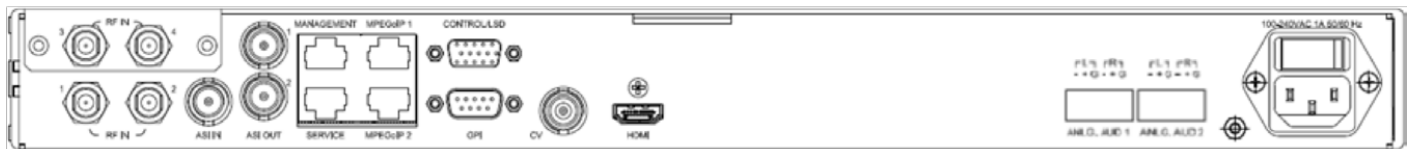
ProView 8110 Descrambler and Analog Decoder ASI, IP, MPE data, composite video, HDMI and two balanced analog audio outputs